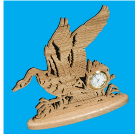
Bill Nagle—Scroll saw goose landing, red oak and plywood.