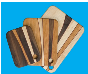
Jim Bany— cutting boards, maple, cherry, walnut, purple heart.