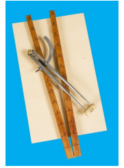
Craig Arnold—Sector Cherry, magnet, brass hinge