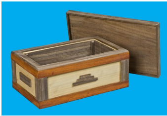
Dan Gregurich— box of poplar, walnut, and pernamcubo.