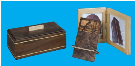
John Tegeler— walnut box, picture frame holder, card holder