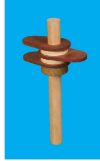
James Childress—cam set. Pear wood, blood wood and mesquite.