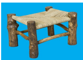
Mike Regan—rustic stool, hickory with sea grass