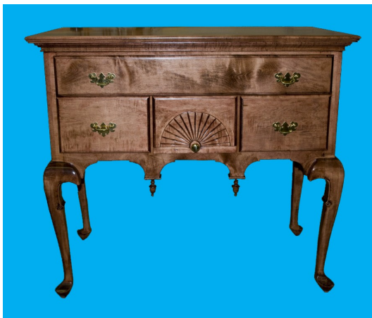
Maple Low boy by Blaine Allen