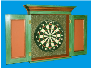
Dart board Finished with milk paint, hand and machine made moldings. Used Stanley 45 and 55 planes. Knock down bookcase. Note tusk shaped pegs. — both, James Childress