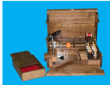
Fly tying kit—Kim Grainger