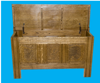
Blanket chest with carved oak tree patterned panels —Bob Young