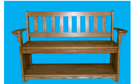
Hall bench made with special rescued wood.—Harry Shelton