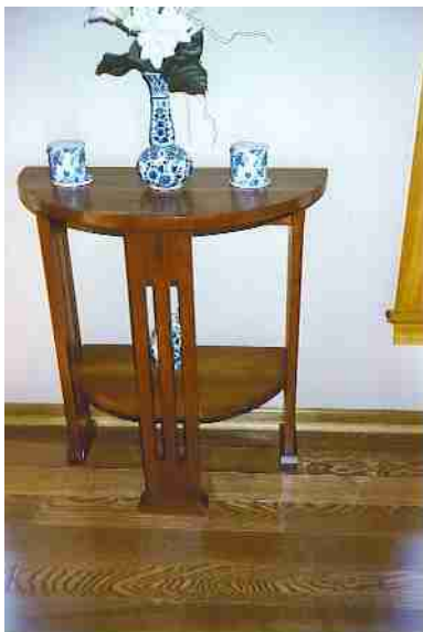
Frank Layne – Half - Round Table