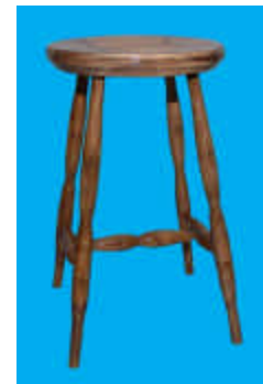
Ken Grainger - Stool