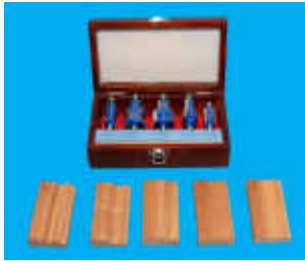
Bill Evans - Trim molding & the Router Bits he used