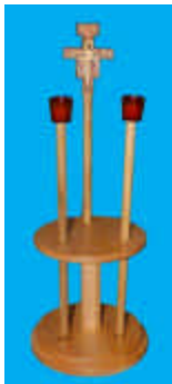
David Roth - Cross & candle Holder