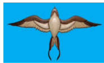
David Roth - 2 Intarsia Birds