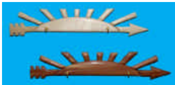
David Roth - 2 Intarsia Arrows of Light