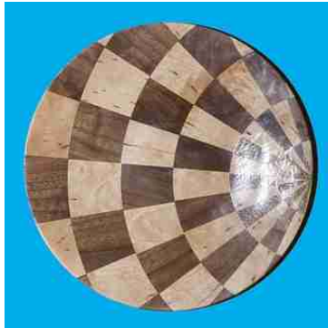
Bill Kuhlman – Segmented Walnut and Red Birch plate