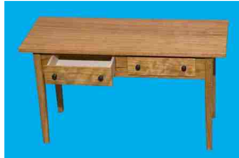
James Childress – Small Scale Cherry & Oak Table