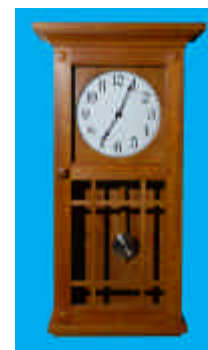
James Childress cherry wall clock.