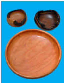
Phil Akers' three bowls with a natural edge