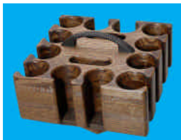
Jerry Jennings poker chip holder out of white oak