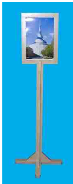
Bill Webb – Maple sign holder