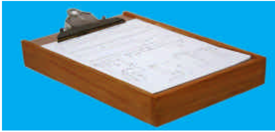
Ken Grainger's Sycamore clip board box