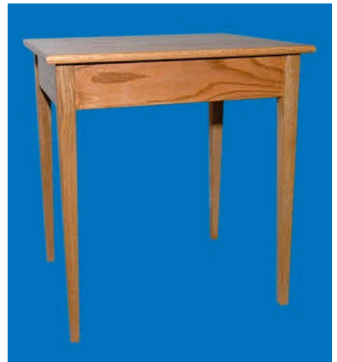
Jim Reynolds Oak end table with an oil based stain