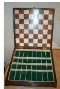
Maple, Rosewood and Walnut Chessboard box