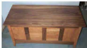
Cherry, Walnut and Cedar lined sweater chest