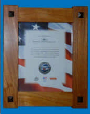
Bill Evans's Example of the picture frame project