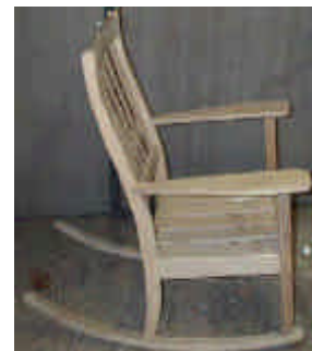
White Oak rocker