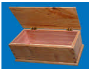
Cherry and Cedar box

Do not be afraid of hand tools. It may take a while to learn their intricacies, but often, they are “faster” than the best power tool you have in your shop.