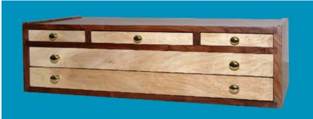
Rick Hetheringtons Walnut & Maple Tool Chest