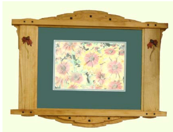
James Childress' picture frame made from cherry, walnut, redbud, paduk, and ironwood.