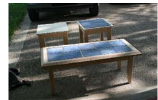
Gift Tables in progress