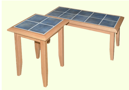
Jim Bany's Oak Tables