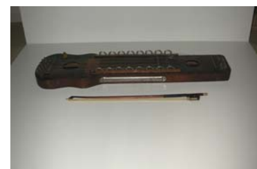
Erl Poulins' very special Ukelin