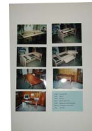
Ken Noegels' Mission style computer desk pictures