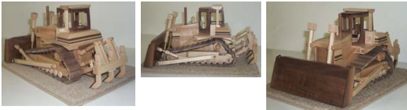
Jerry Boones Toy bulldozer made from S5S pieces of walnut and maple.