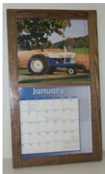
Jim Reynolds Calendar frame made of sassafras; with a pencil groove built in.