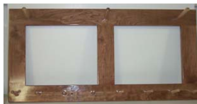
Bill Webbs Coat and hat rack made of cherry. Pegs were turned from maple dowels. He also showed the drill jig he used to drill the peg holes at an angle.