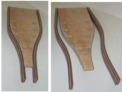
Rod Hansens laminated, curved multiwood parts, which are used as parts of a child's push toy.