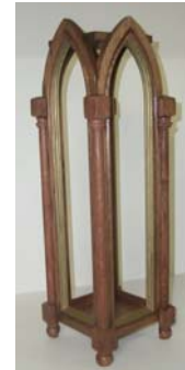
Gene Caples Arch pattern flowerpot stand made of white oak.