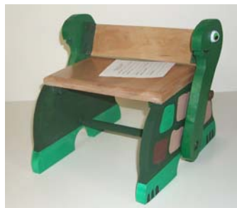
Howard Johnsons Child's footstool made of oak.