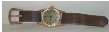
Gary Caldwell's Wrist watch clock made of red oak and walnut.